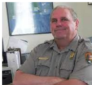
Unit Coordinator, Sandy Hook