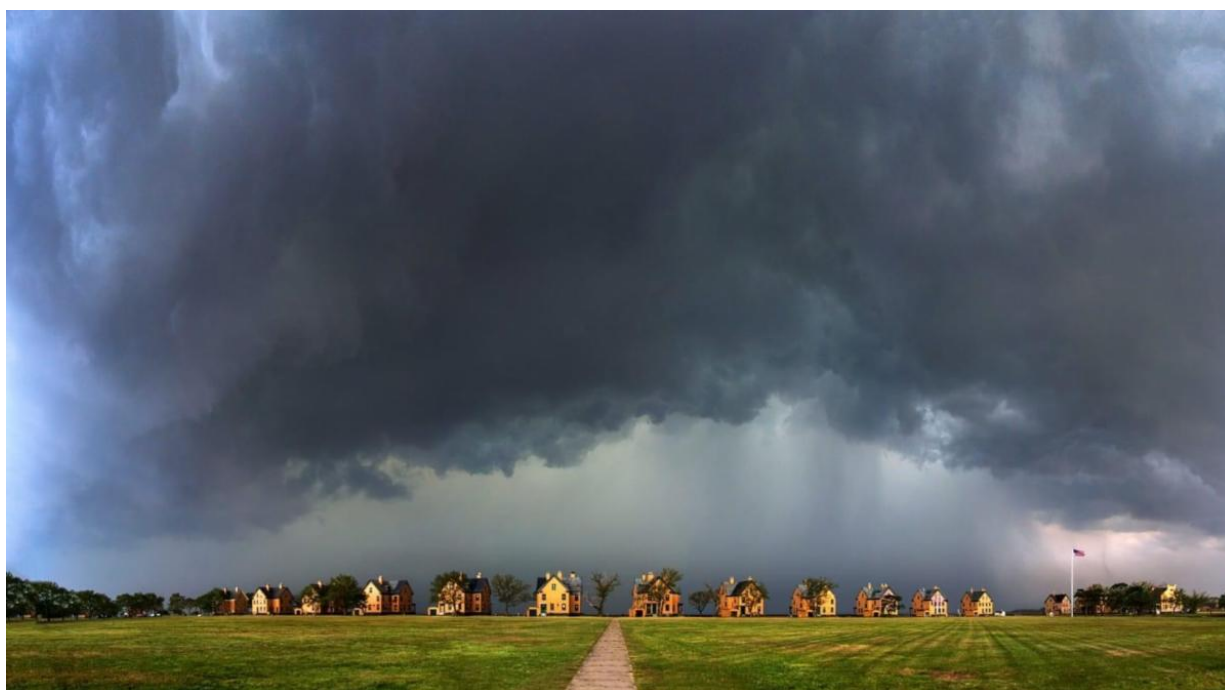
The Storm on Wednesday, May 26, 2021, over Officer's Row.